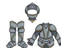
suit of armour