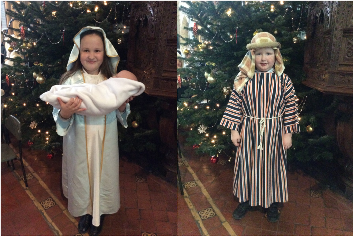
Weren't our Year 2 children amazing in our Nativity production! Thank you to all those who came to watch and those of you who helped with the staging and encouraging your child to learn their lines. We were very proud of them all.