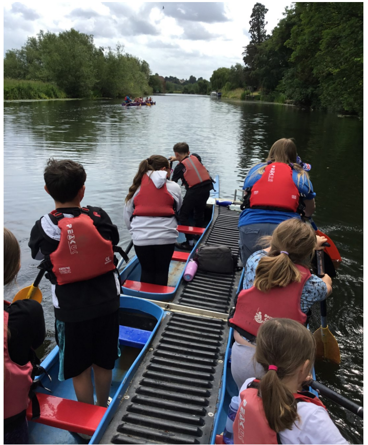
Bellboating fun at Fladbury!